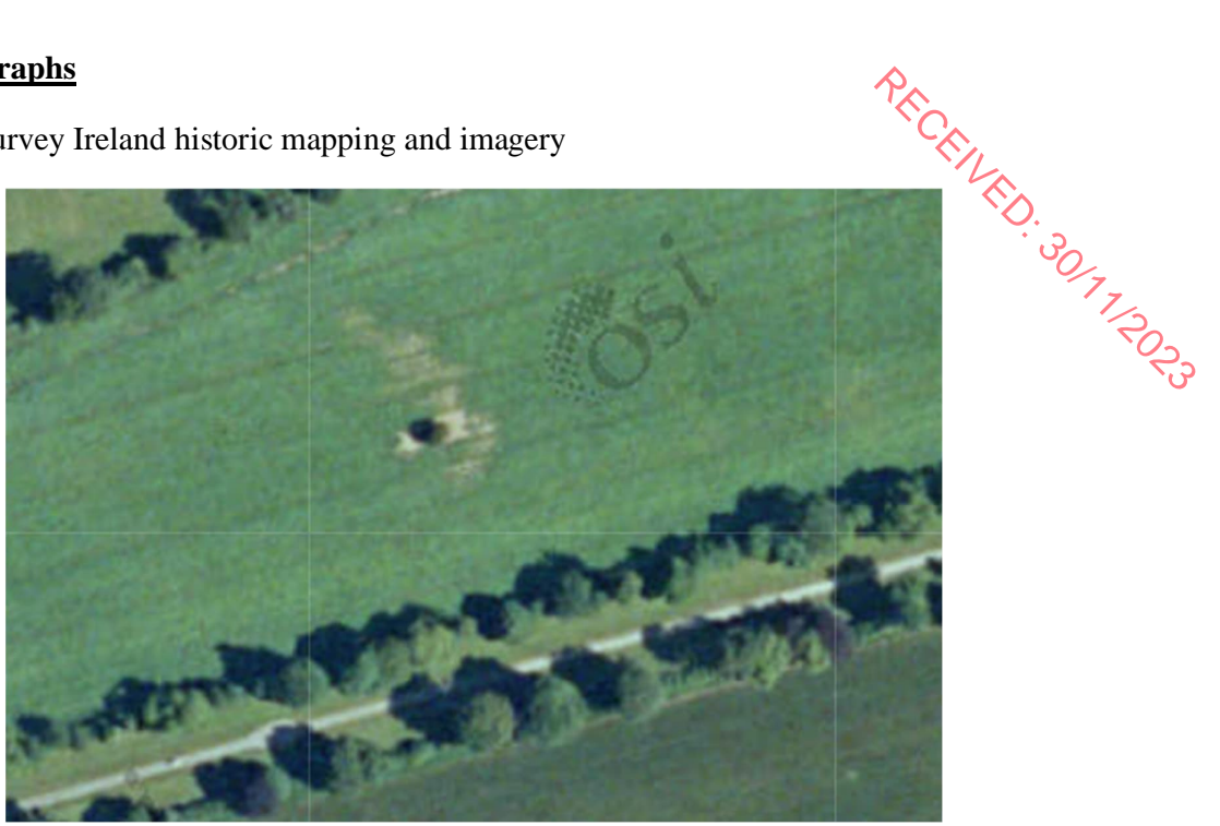
Photo 1 A clip of historic aerial/satellite photography from 2001. Note is made of poor/rough ground in vicinity of tree.

Ordnance Survey Ireland historic mapping and imagery